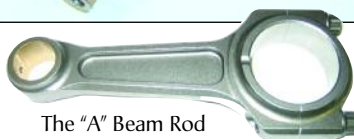
The "A" Beam Rod